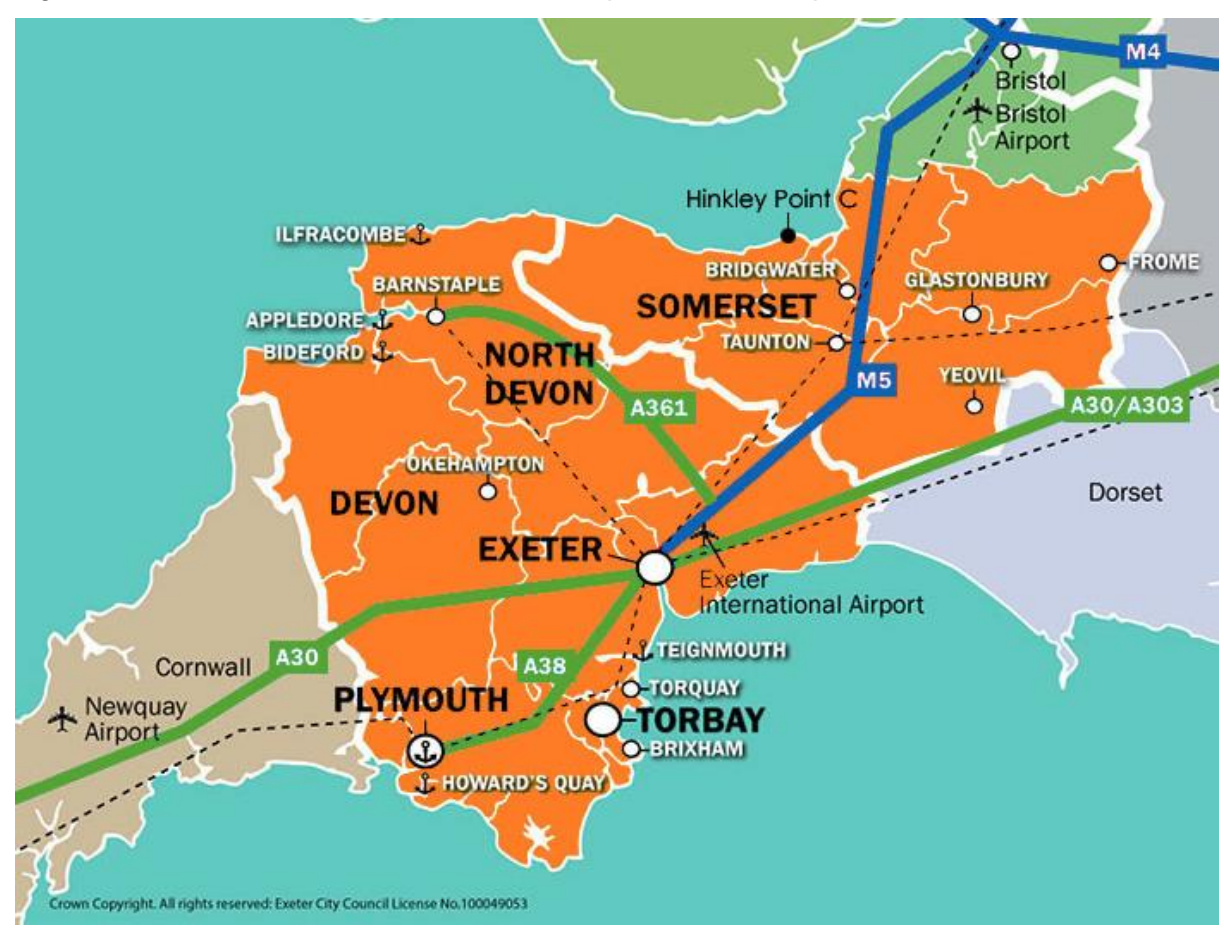
Figure 1: Heart of the South West Local Enterprise Partnership